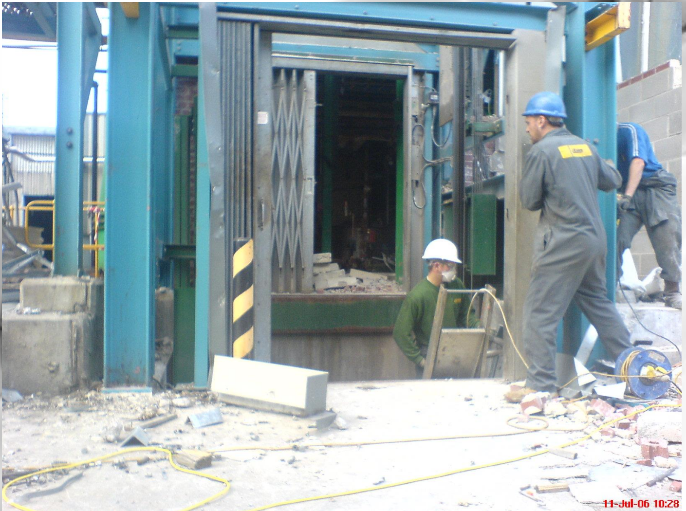
Above – Preparing the entry and exit points so the lift was free for removal.