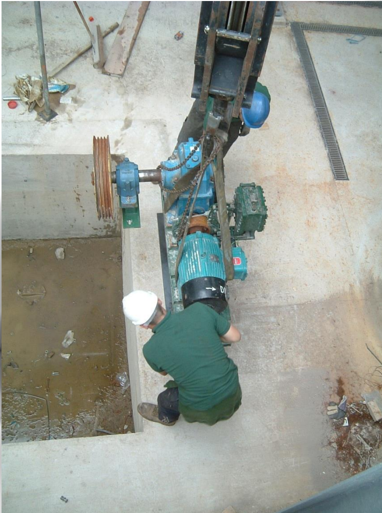
Left – positioning the winding gear