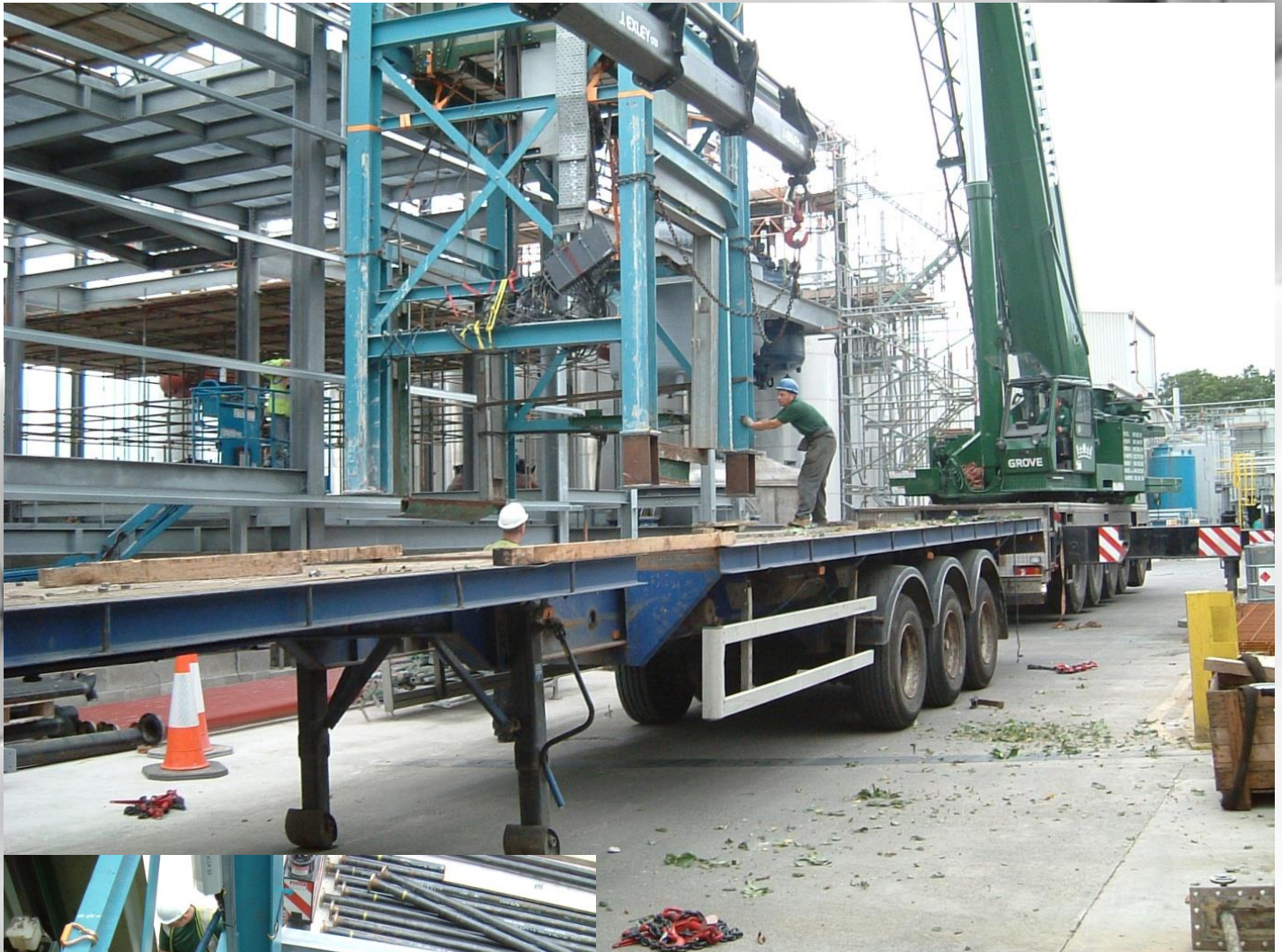
Above – the new feet are secured to the lift base.