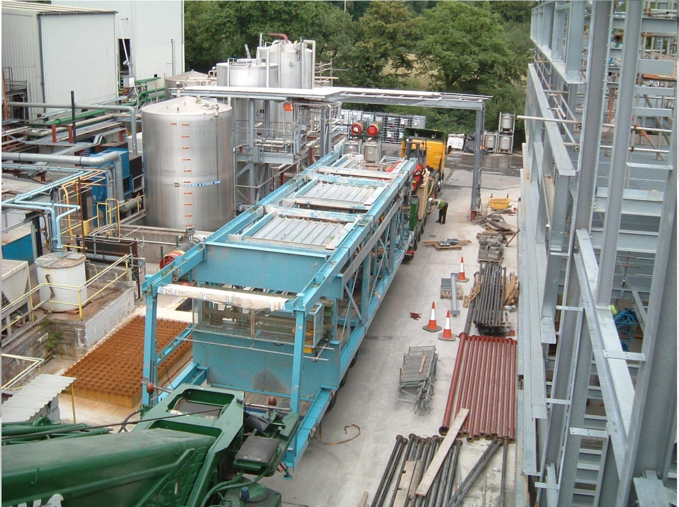
Above – the plant is positioned ready to commence the installation.