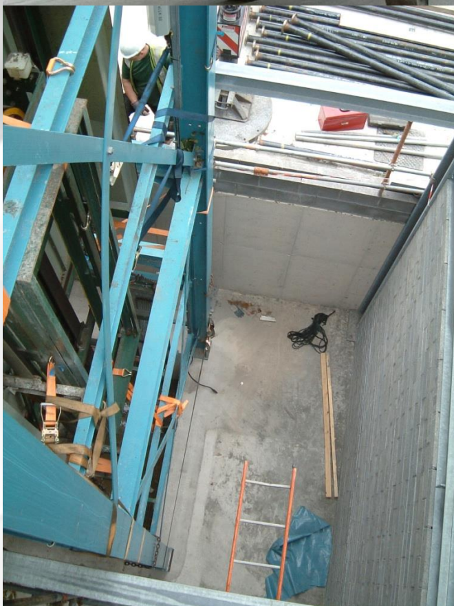
Left – the lift is carefully ‘threaded’ between the building’s steelwork into its final position.